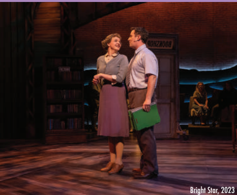
Bright Star, 2023