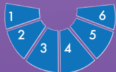
Marian Theatre 440 Seats

Elf the Musical 1:30pm matinee performances.