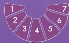
Solvang Festival Theater 700 Seats